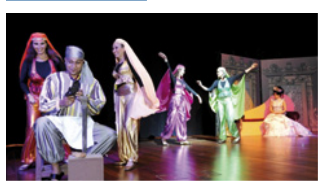
Hakawati at the Abu Dhabi University Week of Welcome

As part of ADMAF Community's commitment to the art of traditional Arabic storytelling, it presented a Hakawati performance at Abu Dhabi University during the Week of Welcome (ADUWOW), held annually to welcome new students and mark the upcoming academic year. Inspired by stories from 'One Thousand and One Nights', and integrating aspects of Emirati culture and customs, the Hakawati (or traditional Arabic storyteller) and his troupe performed a series of amusing vignettes, each carrying a moral message. The play sought to encourage the Emiratis undergraduates to appreciate and engage with their cultural heritage.