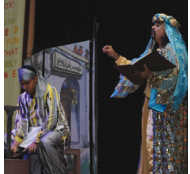
Hakawati at the Abu Dhabi University Week of Welcome