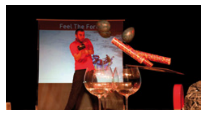
Big Bang - Feel the Force

During Abu Dhabi Festival, ADMAF Education highlighted the value of arts-based teaching to improve student learning around a variety of subjects, such as mathematics, physics, science and geography.