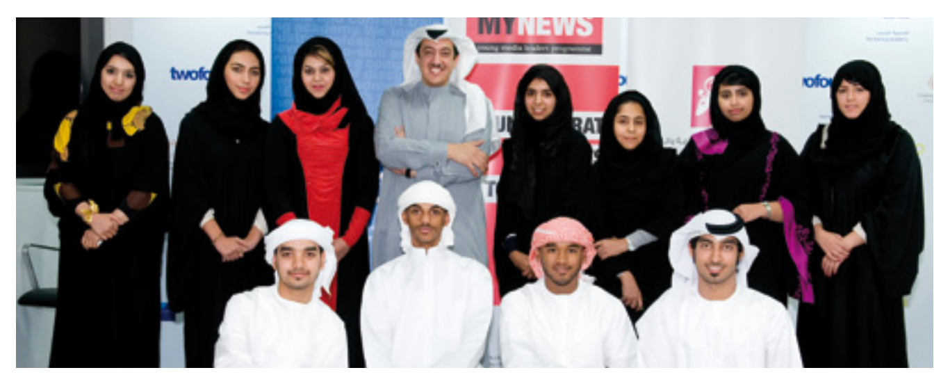
Renowned broadcaster Turki Al Dakheel with YML students

The Young Media Leaders (YML) programme empowers young Emiratis with knowledge and training to help them become key players in future media industries. The nine-month vocational programme trains and mentors a core group of Emirati students and young professionals in news reporting, magazine production, photography, copy writing and editing and all aspects of TV and radio broadcasting. There is also an increasing focus on online journalism, social networking, blogging and mobile communication, as they continue to impact the modern media landscape. Since the