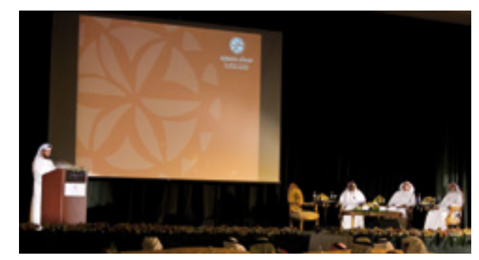
Abu Dhabi Music & Arts Foundation at the Arab Culture Forum in Ajman

The Arab Culture Forum, organised by Ajman Culture and Media Department and supported by ADMAF addressed the importance of literacy and literary awareness. The Forum's objective was to increase the community's cultural awareness and to stress the importance of books in terms of reading, education, culture, urban planning, social behavior and civil rights. This Forum also focused on developing the national identity of the UAE and to support the education of nationals. The discussion highlighted the need to promote the value of libraries and the importance of literacy in the increasingly digital age.