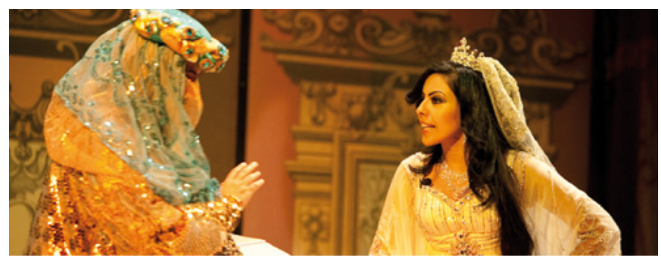
Hakawati performance in Abu Dhabi