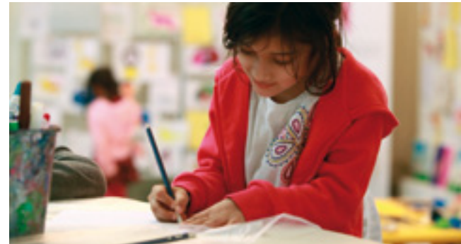
Picasso Project - A workshop at Ewa'a Shelter in Abu Dhabi

During the Abu Dhabi Festival, ADMAF Community upheld its commitment to empowering victims of abuse and exploitation using the arts by collaborating with its civil society partner and Abu Dhabi Festival 2011 nominated charity, Ewa'a Shelters for Women & Children. Ewa'a provides temporary shelter for women and children victims of human trafficking and offers them assistance as well as support in rehabilitation. ADMAF facilitated an art workshop delivered by The Picasso Project, where women residents had the opportunity to express themselves using a variety of materials, such as paint, charcoal, clay, pastel and sand.