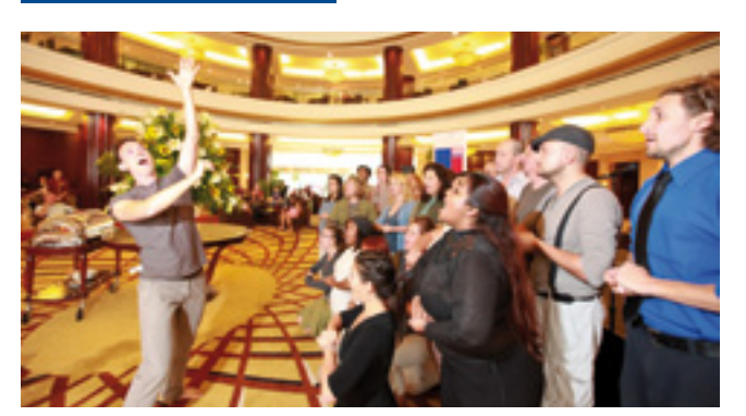
Signing sensations at Beach Rotana Hote

During the Abu Dhabi Festival, ADMAF Community highlighted its year-round support of community music initiatives by staging a series of concerts by three talented Abu Dhabi-based community a capella (without accompaniment) groups. The Abu Dhabi Choral Group, Blue Fever and Voices of Harmony are part of a larger, Abu Dhabi-based, community music organisation called Artnetwork. The mini concert, held at the Beach Rotana Hotel, brought together a wide range of expatriate residents under the umbrella of music. It provided a public platform for grassroots cultural expression and exchange and offered an accessible musical experience for the general public.