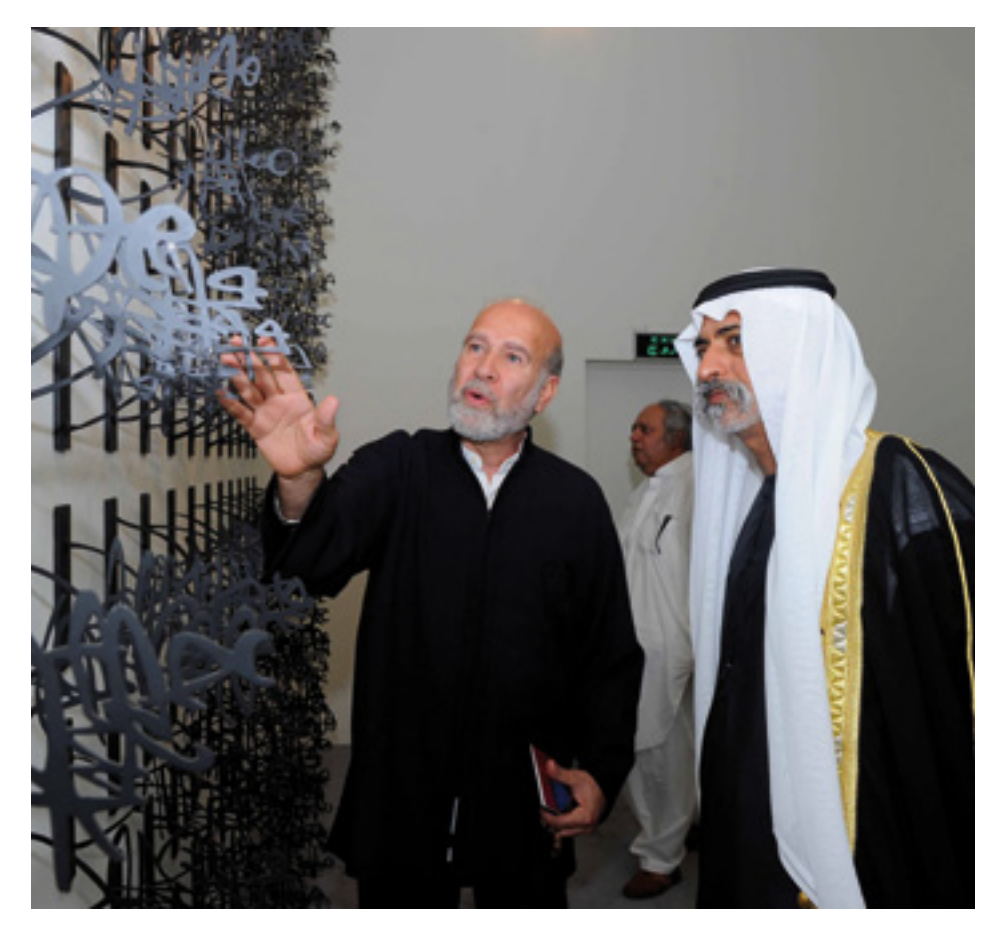
H.E. Sheikh Nahyan Mubarak Al Nahyan visits the Abu Dhabi Festival 2011 exhibition "Path of Roses" with its creator, the artist Rachid Koraichi