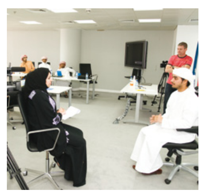
Young Media Leaders workshop