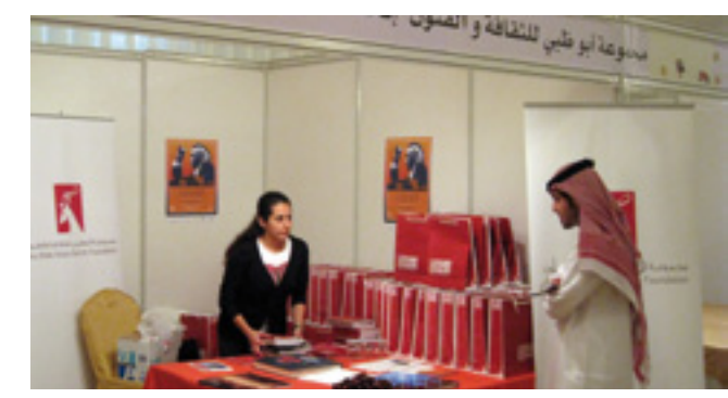
ADMAF participates in the Mirfa Cultural Festival

ADMAF Community participated in the Mirfa Cultural Festival in the Western Region (Al Gharbia). Organised by the Ministry of Culture, Youth, and Community Development to promote culture and education in the Western Region. ADMAF took part in this event by distributing educational and cultural collaterals to the Mirfa community and help raise awareness around ADMAF's role in supporting community arts and arts education. It also gave ADMAF representatives the opportunity to strengthen relationships with key community partners in the Western Region.