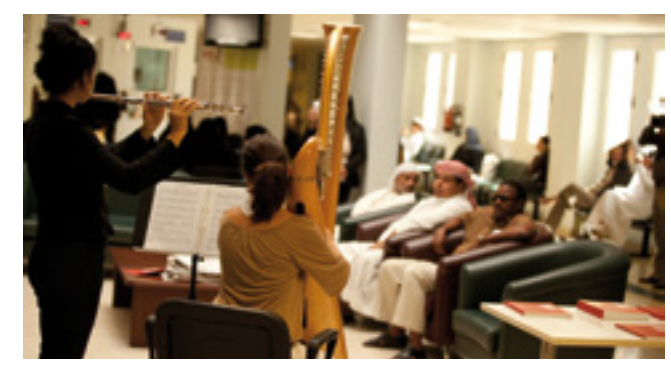
Music in Hospitals - Talented musicians visit Mafraq Hospital in Abu Dhabi and Twaam Hospital in Al Ain to play for patients

Music offers far more than mere entertainment, particularly when it is used in hospitals. As part of a long-term ambition to embed the adoption and practice of music in hospitals, the Community Programme of the Abu Dhabi Festival presented a series of small concerts at Mafraq Hospital in Abu Dhabi and Twaam Hospital in Al Ain. The music which was performed by locally based musicians was well received by patients and medical staff alike, and has opened the door to continued provision and deeper dialogue on the merits of music and health.