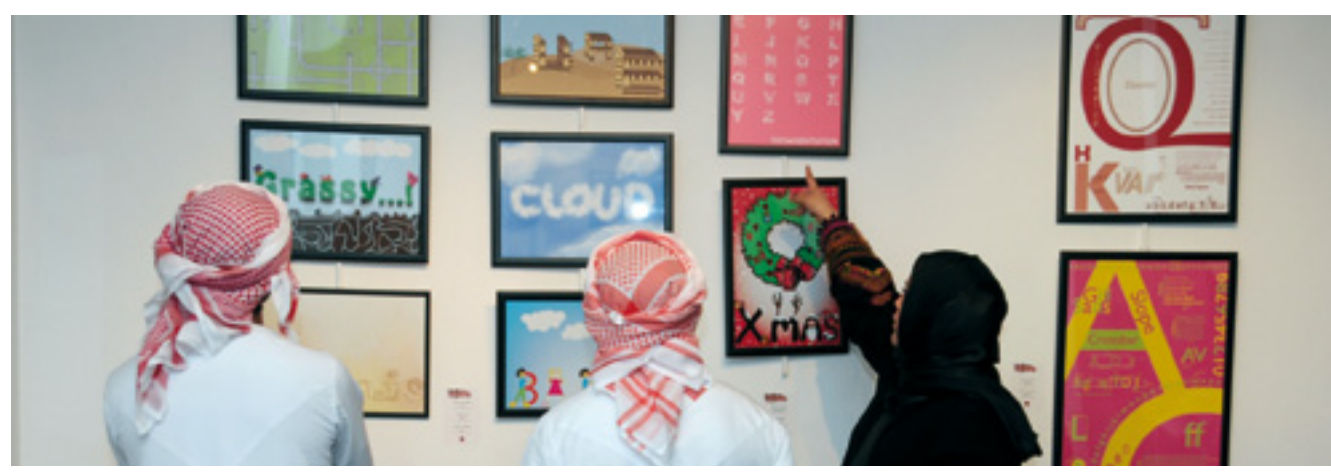
Artworks by HCT Woman students at the Desert Rose Exhibition

ADMAF entered into a partnership with the Abu Dhabi Women's College in March of 2007 in order to solidify the relationship between the two entities, which had begun some years earlier. The two partner institutions continue to work together to provide the students of ADWC with international opportunities through exposure to travel, art, music, educational and cultural workshops and visits with internationally recognised guest lecturers. ADMAF also encourages creativity amongst the students of the college by regularly supporting student exhibitions.