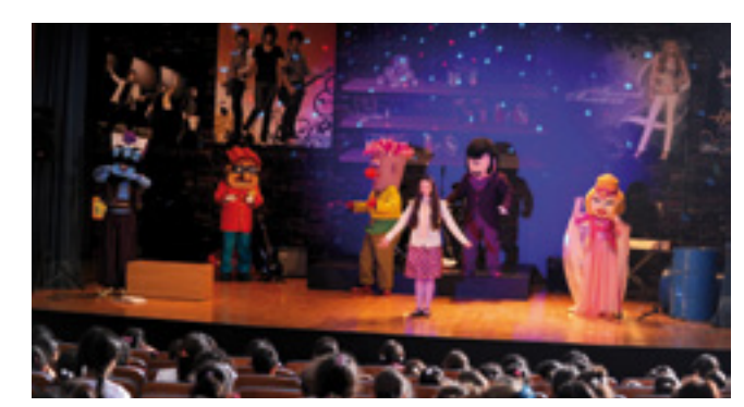
"1001 Stories" an original play by Pauline Haddad

The International Mother Language Day, launched by UNESCO in 1999, promotes linguistic and cultural diversity and multilingualism. To celebrate Mother Language Day and promote the Arabic language (Fus'ha), ADMAF Education organises an annual series of initiatives in Abu Dhabi's schools and universities.