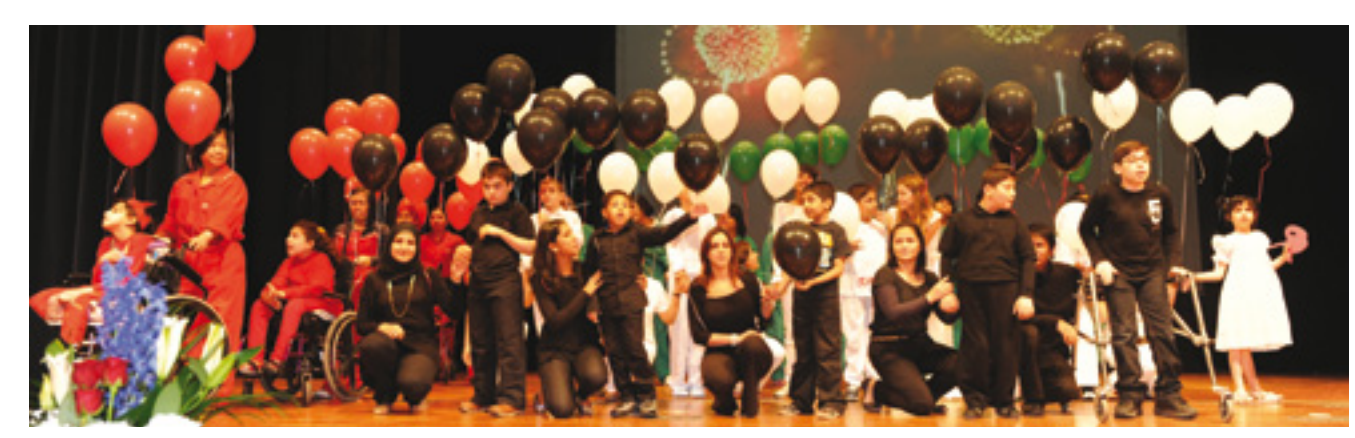
Children celebrating the 10th Anniversary of the Future Centre for Special Needs

ADMAF Education enjoys a long and fruitful partnership with the Future Centre based on a shared set of common goals – to create a positive learning environment and enable people with special needs to discover their talent, reach their full potential and realise a better future. Over the years, the Future Centre's students have shown just how much they cherish the chance to play and to sing. In turn, their teachers have witnessed the tremendous impact music can have on pupils' physical and cognitive development. Live Music Now, the leading music organisation from the UK, returned to Abu Dhabi