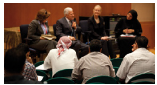
ADMAF Community panel discussion at the Abu Dhabi Centre for Care & Rehabilitation in Mafraa

During the Abu Dhabi Festival, ADMAF Community held a panel discussion at the Abu Dhabi Centre for Care & Rehabilitation in Mafraq to explore the transformative impact of music on children with special needs and the growth of this field in the UAE. Hosted by Zayed Higher Organisation, the public discussion welcomed speakers from Abu Dhabi Autism Centre, Live Music Now and ZHO. It attracted a significant audience of ZHO staff and parents and led to a frank and dynamic discussion around the acceptance and application of music in special needs education. The issues raised will contribute to ADMAF Community's work in the area of special needs development.