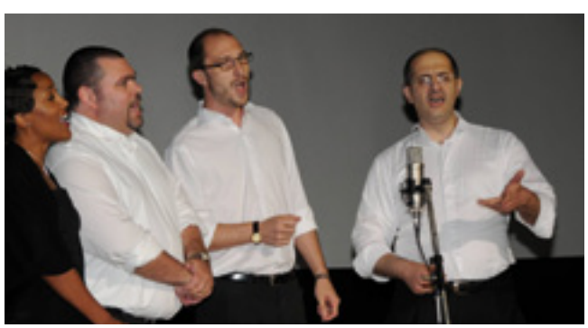
Just voices acapella concert

Blue Fever and Voices of Harmony, a talented jazz ensemble and an all-female barbershop group, presented a lively concert for the community of Abu Dhabi city. The two groups are part of a larger community music organisation called Artnetwork. The concert brought together members from a wide spectrum of expatriate communities and helped celebrate their musical talents. It provided a dynamic forum for grassroots cultural exchange and offered an accessible musical experience for the community. By supporting concerts such as this, ADMAF hopes to encourage other social groups to utilize their talents and artistic skills.