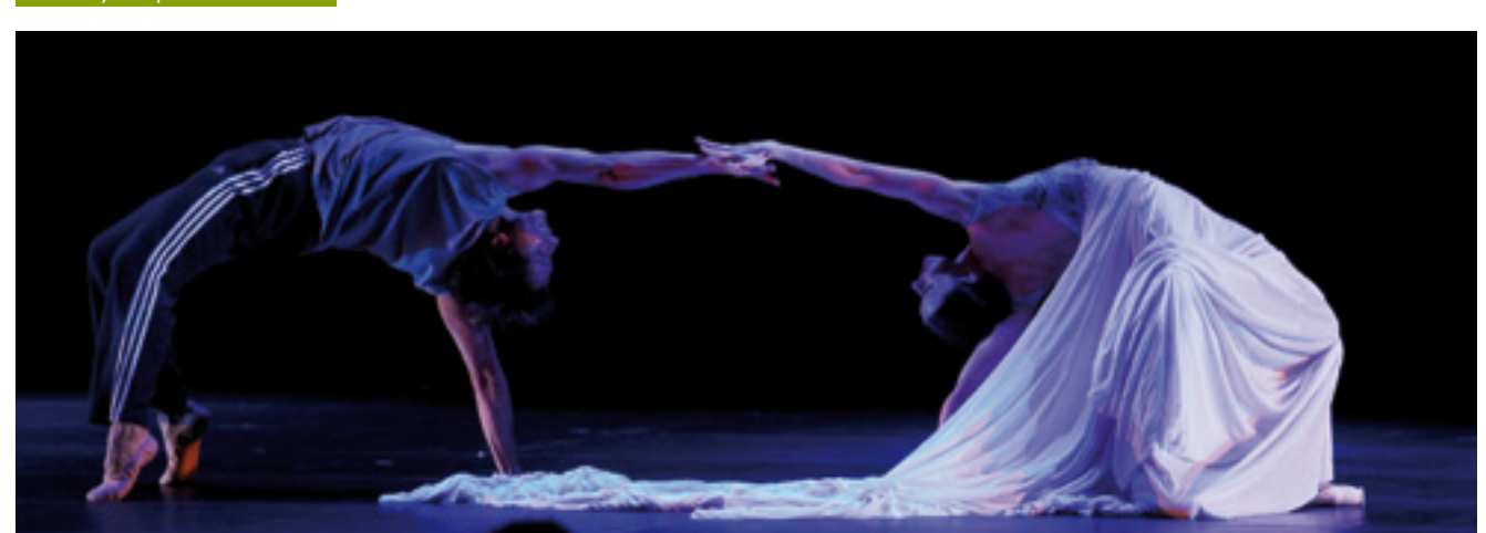
Ballet Gala Open Rehearsal

As part of ADMAF Education's commitment to arts education, The Abu Dhabi Festival Education programme annually features a series of open rehearsals; giving students unique insight into a variety of art forms represented in the festival's main performance programme at Emirates Palace.