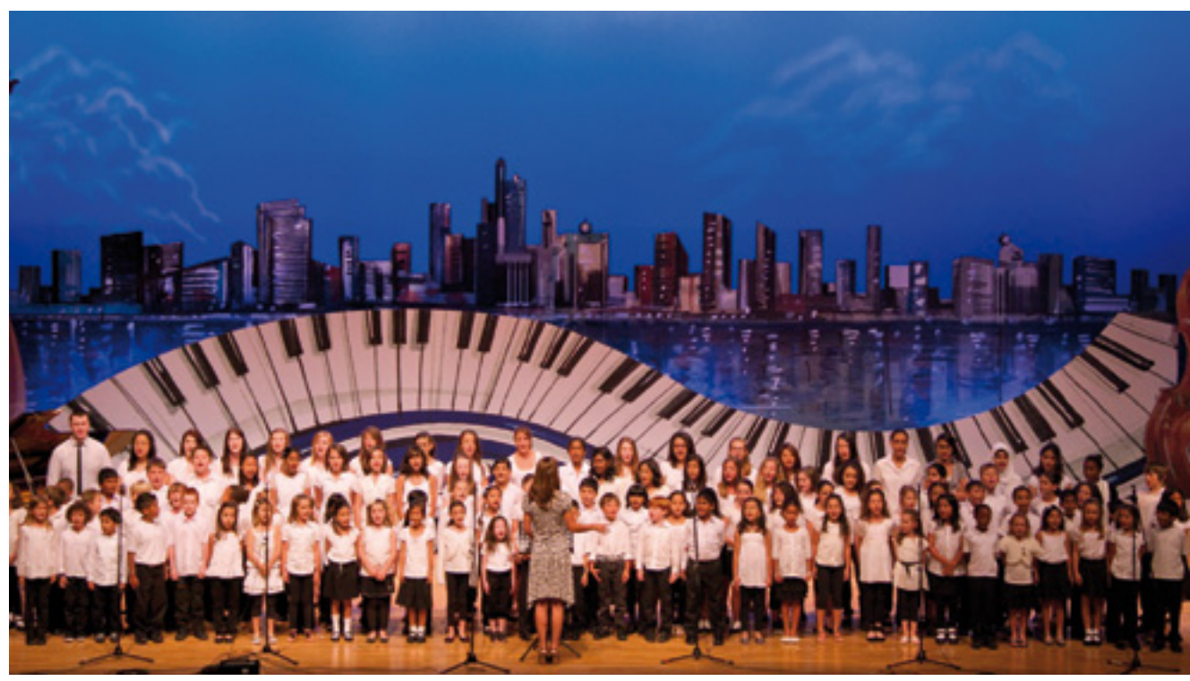
Young Artists Day - afternoon performance

During every Abu Dhabi Festival, ADMAF Education stages Young Artists' Day, a culmination of months of rehearsals that brings together schools from across Abu Dhabi. Student musicians (soloists, chamber groups, choirs, bands and orchestras) are selected to perform onstage at Emirates Palace during the day. This is followed by an evening performance of an original composition, written by selected young musicians from Abu Dhabi during a residential course led by the UK cellist and music educator, Matthew Barley, and his ensemble Between the Notes. Through Young Artists' Day, ADMAF Education seeks to engage the young in cross-cultural dialogue through music; nurture a competitive spirit of musical excellence among the schools of Abu Dhabi: encourage young musical talent: and motivate higher educational performance.