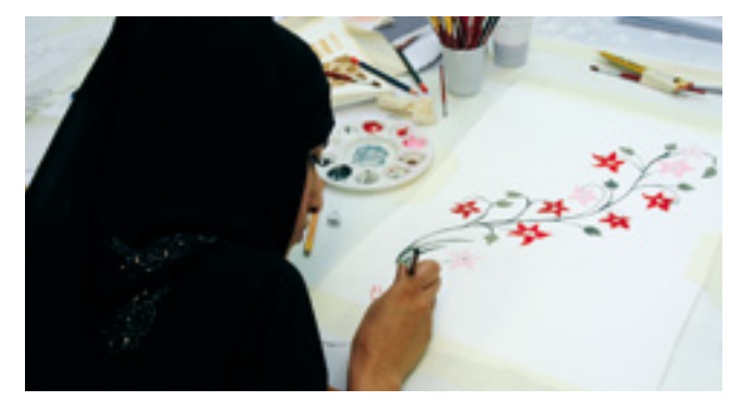
Workshop dedicated to the revival of traditional Islamic arts practice