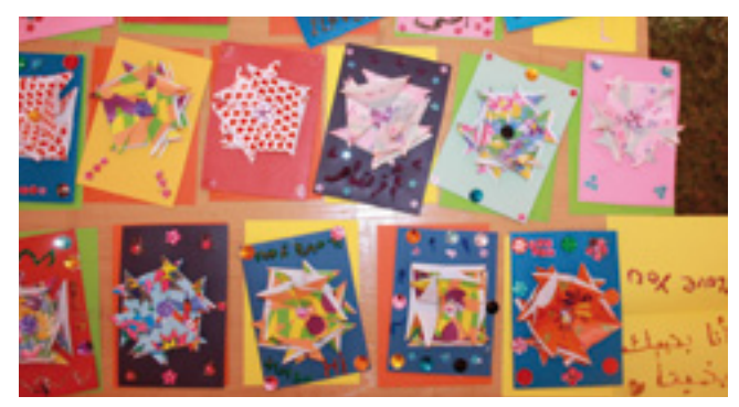
Artwork by the women and children at DFWAC

The arts can be used to build self-esteem, confidence and communication skills - in short, strengthen the spirit. ADMAF joined forces to provide the women and children residents of the DFWAC shelter with a one-day arts camp. This consisted of a twohour workshop of jewellery-making, origami, painting and collage, followed by a drumming circle. The camp contributed to DFWAC's aim to restore self-confidence and self-expression back to these women and children and used the arts to facilitate interaction and bridge-building.