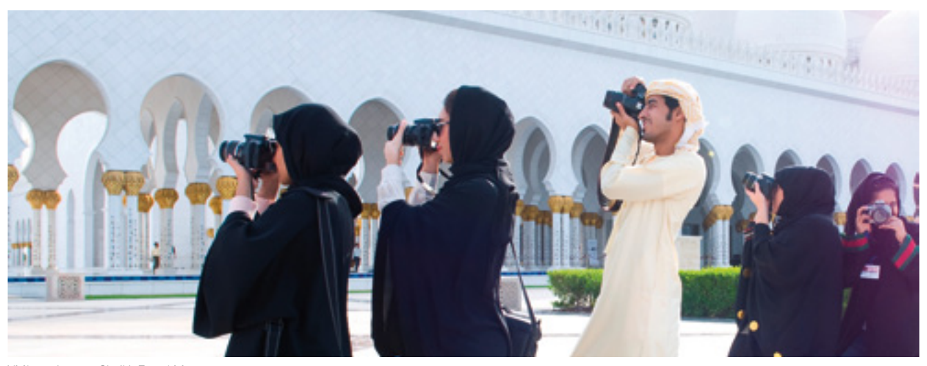
YML students at Sheikh Zayed Mosque